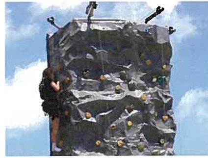
The 20m Rock Climbing wall was a HUGE highlight!