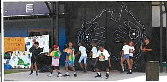
Yr 4/5 performed the story of "How the birds got their colour"