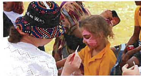
Our talented staff face painted over 40 kids!