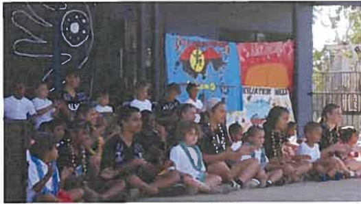
Prep, Year 1 and High School performed "Taba Naba"