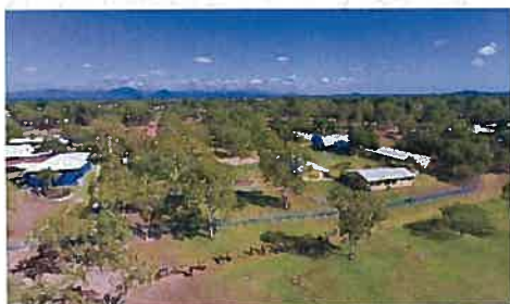
A special photo of our march from above with a drone